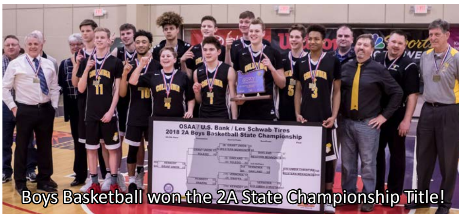
Boys Basketball won the 2A State Championship Title!