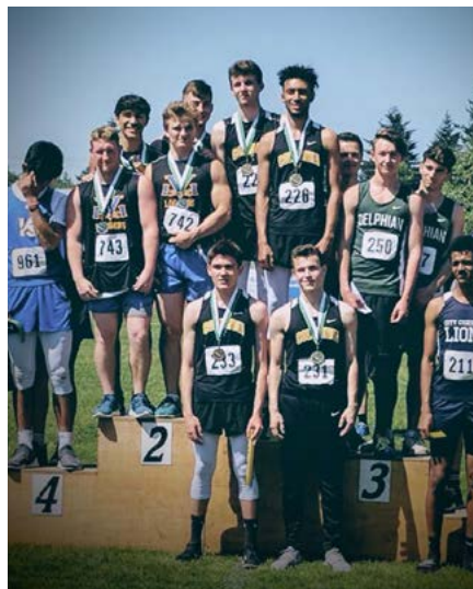
Both boys and girls 4x100 relay teams placed 1st at Districts.