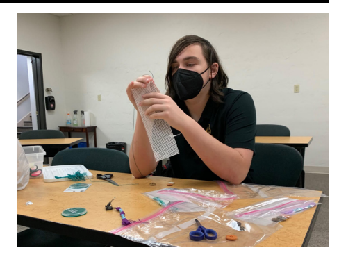
In their Connections class sessions, high school students learn many practical skills - like simple sewing techniques.