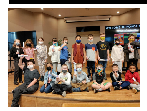
Elementary students receive recognition and incentive for demonstrating characteristics of a "self-manager".