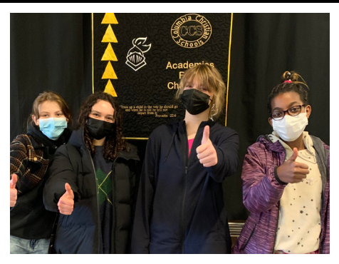
Middle school students develop interpersonal skills to communicate effectively and build healthy relationship.