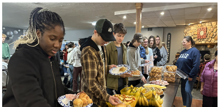
High school students enjoyed a Finals Breakfast from PTF