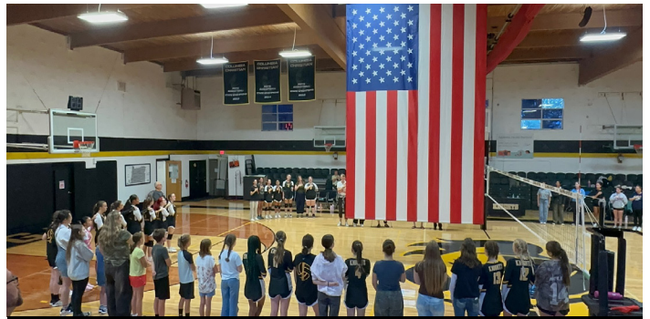
New U.S. flag installed in the gym thanks to generous donors