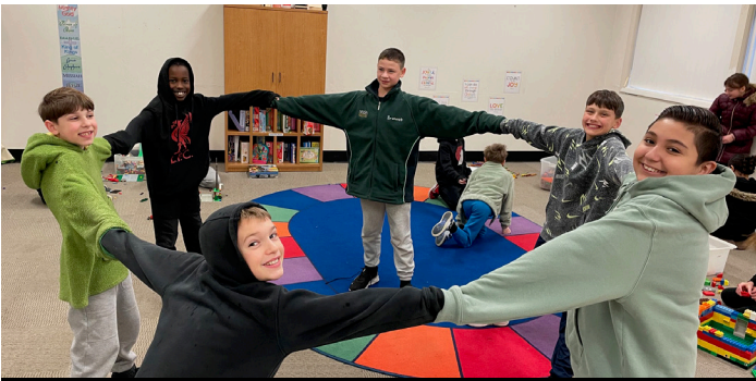
Students having fun at recess, indoors and out