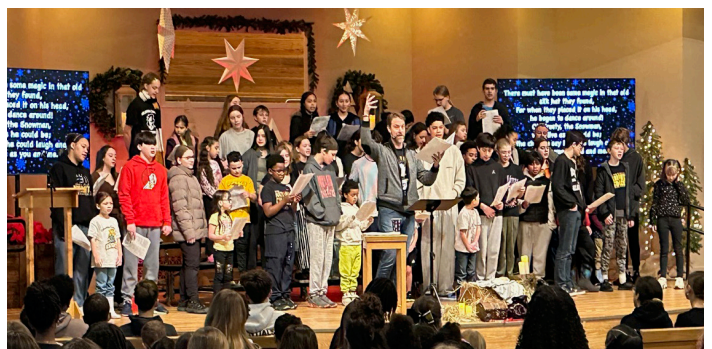
School-wide Christmas caroling chapel celebration