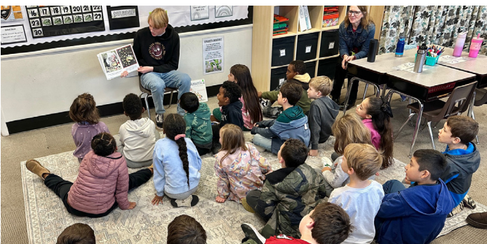
Creative Communication students practiced reading in elementary classes