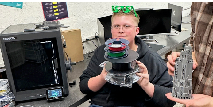
Projects from the new 3D printer donated to the lab