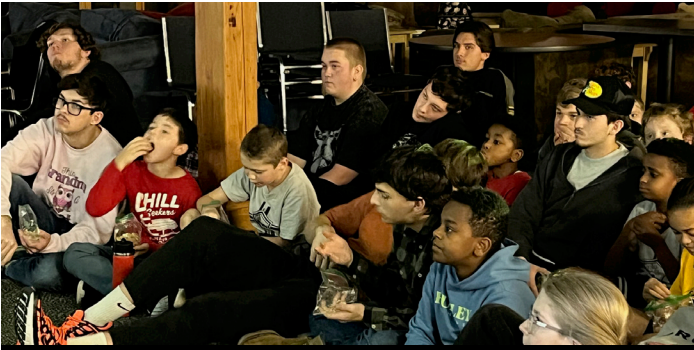
Big & Little Buddies enjoyed snacks and a movie at the Charlie Brown Thanksgiving Party