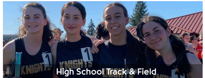
High School Track & Field