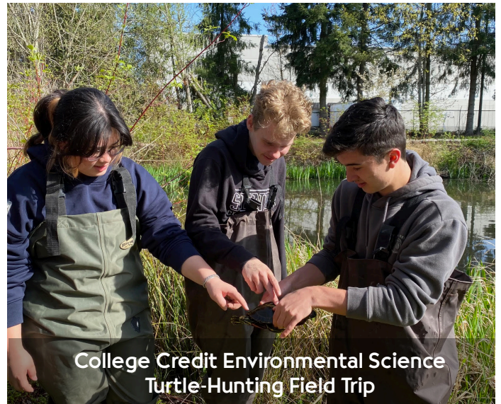
College Credit Environmental Science Turtle-Hunting Field Trip