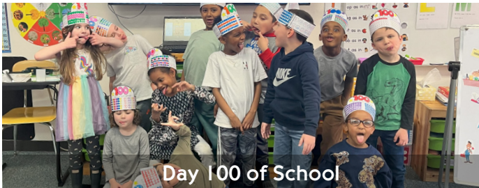
Day 100 of School