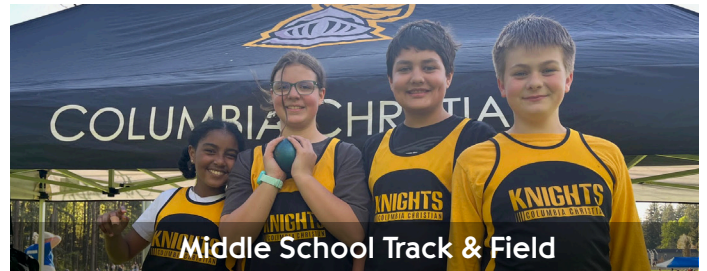
Middle School Track & Field