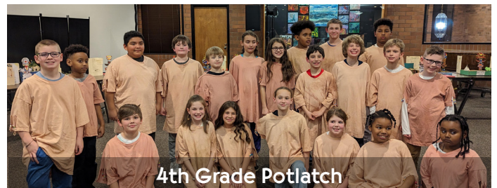
4th Grade Potlatch