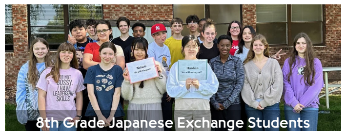
8th Grade Japanese Exchange Students