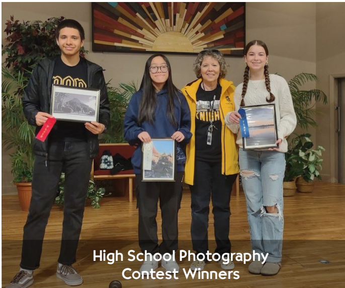
High School Photography Contest Winners