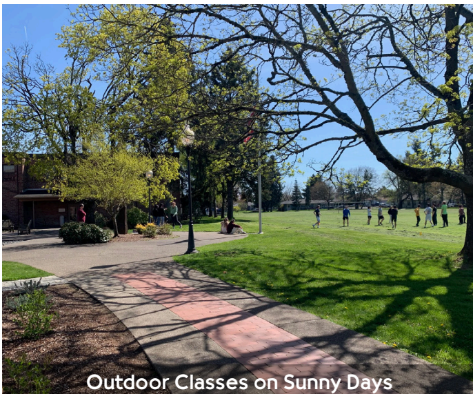
Outdoor Classes on Sunny Days