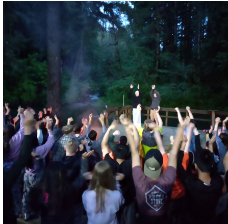
Spring Knight Fest 8th-12th Grade Retreat