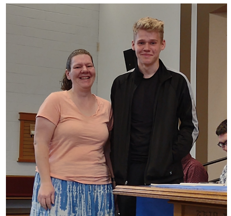
National Honor Society Induction