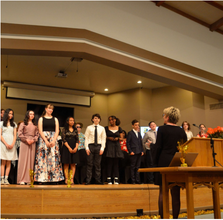
8th Grade Promotion Ceremony