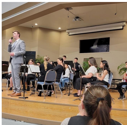
Middle & High School Music Program