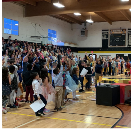
Elementary Knight of Honor