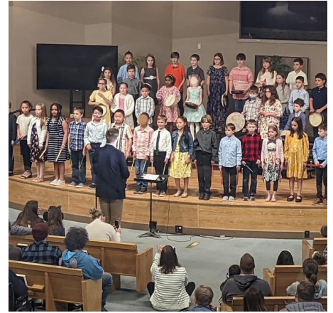
Elementary Music Program