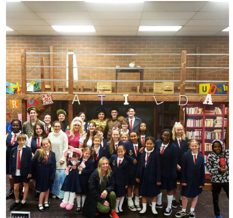
Matilda the Musical Spring Drama