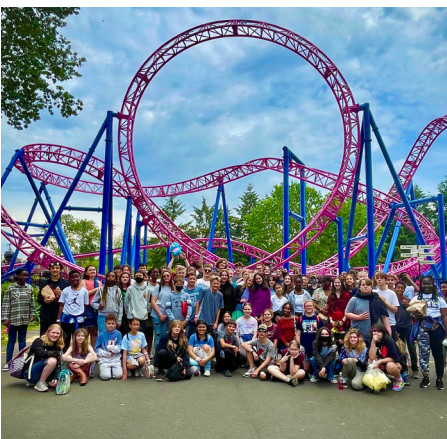
Middle School Oaks Park Day