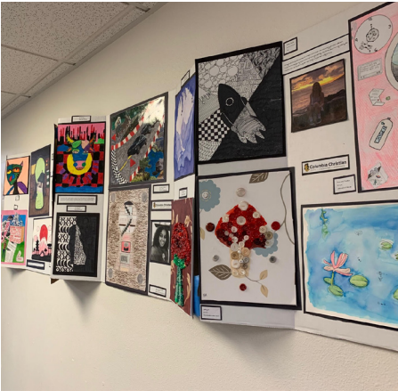
High School Art Showcase