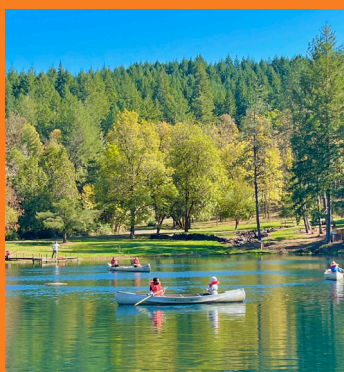
Many Columbia students participated in Camp Yamhill's selection of sponsored camps.