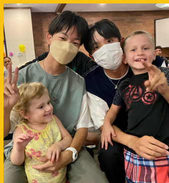
Columbia's campus and families hosted a group of 20 Japanese students for a 2-week program in August.