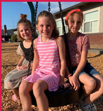
Families and friends joined the "Playground Play Date" in August - complete with treats and lots of sunshine.