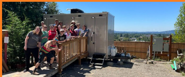
A group of Columbia students joined other teens in improving a local transitional housing community as part of the annual Summer Service Week.