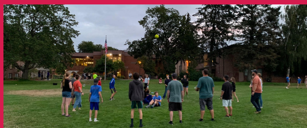
The Eastside and Oregon City Church of Christ youth groups hosted the final "Summer Nights" Youth Rally on Columbia's campus.