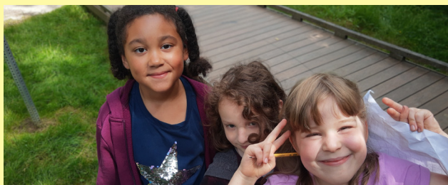
"Knight Quest", Columbia's 5-week elementary summer program, was loads of fun!