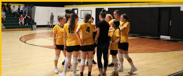
Sports team practices and camps kept many athletes busy throughout July and August.