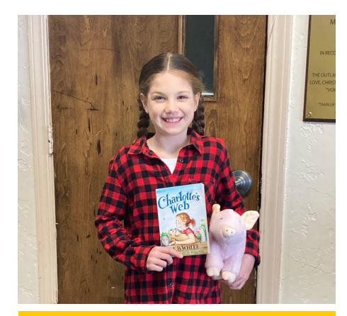
During Read-A-Thon, elementary students clocked a total of 76,217 minutes and brought in $8,340 to support their library and classroom resources. Great job!