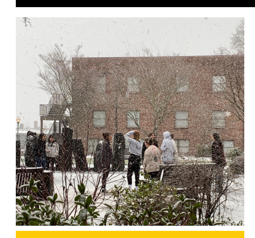
Portland experienced some inclement weather in February which meant "Snow Days" for students!