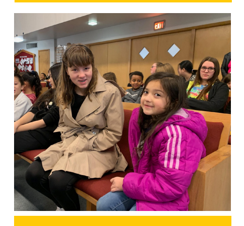
Once per month, the entire student body gathers for "All School Chapel." Big-Buddies and Little-Buddies sit together for this time of worship and devotion.