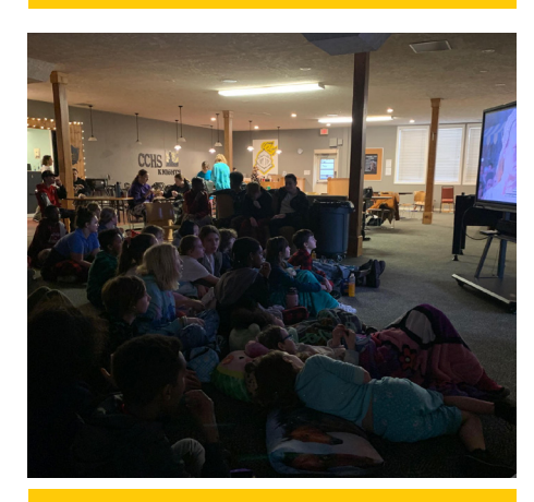
Middle school students enjoyed a movie and popcorn reward in the Student Center at the end of semester one.