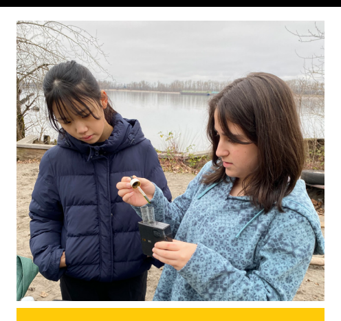
High school Biology class conducted water chemistry tests and planted trees during their field trip service project at Kelley Point Park.