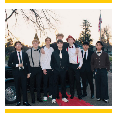
High school students came dressed to impress at their Vintage Hollywood Winter Formal this year.