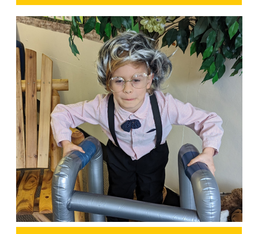
On the 100th day of school, students enjoyed dressing up as centenarians and participating in a variety of math activities.