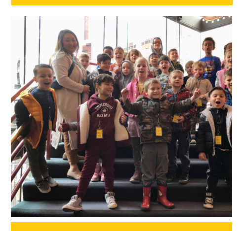
PreK and Kindergarten enjoyed a field trip to watch a performance by the Oregon Children's Theater.