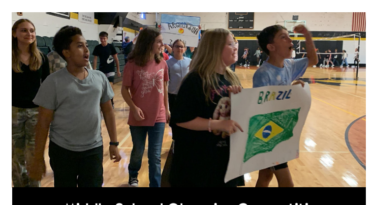
Middle School Olympics Competition