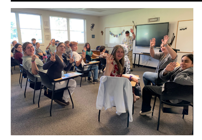
By Pearl Howarth, Guidance Counselor

Columbia remains committed to providing students with the most relevant education possible while also preparing them for life beyond high school. In 2024, it is imperative to remain adaptable and flexible in order to respond to what students need to be successful in the world after graduation.