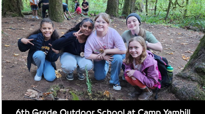
6th Grade Outdoor School at Camp Yamhill