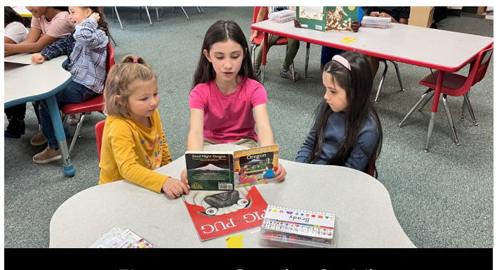
Elementary Reading Buddies