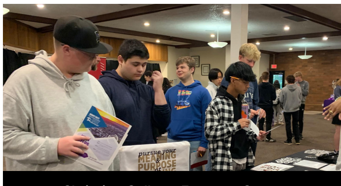
Christian College Expo on Campus