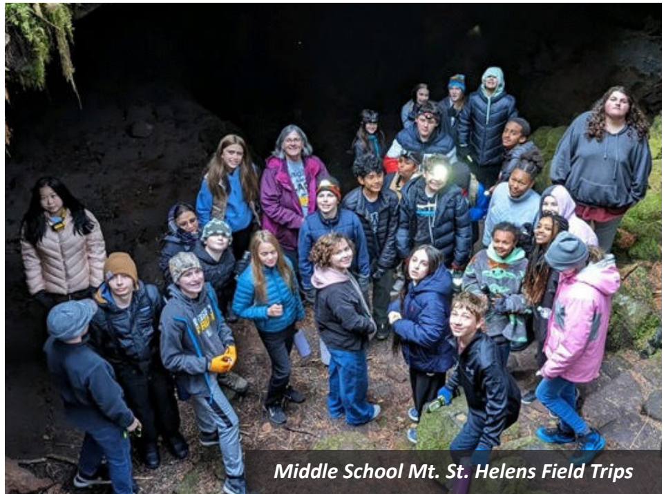
Middle School Mt. St. Helens Field Trips