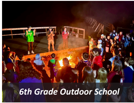
6th Grade Outdoor School