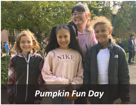
Pumpkin Fun Day