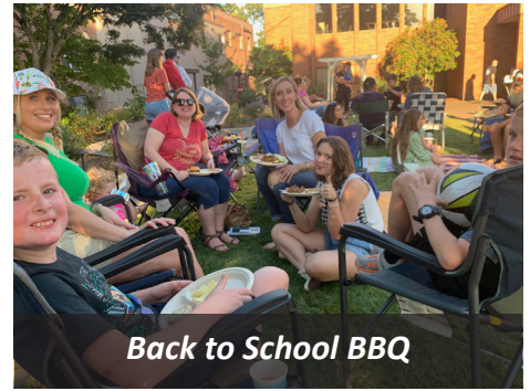
Back to School BBQ