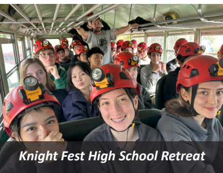
Knight Fest High School Retreat