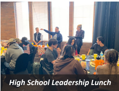
High School Leadership Lunch