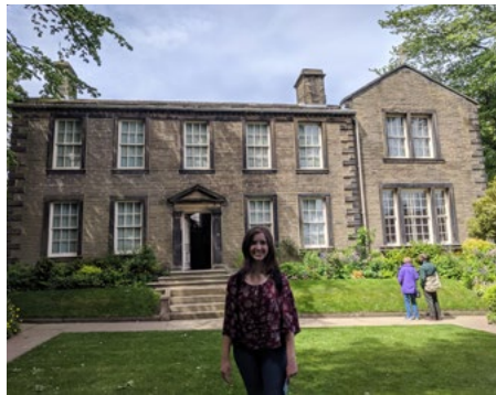
At the Brontë Parsonage Museum