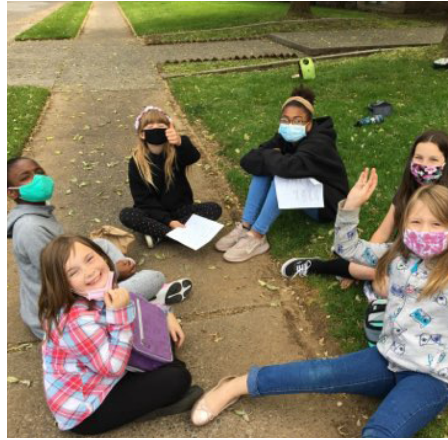
Outdoor Elementary Chapel