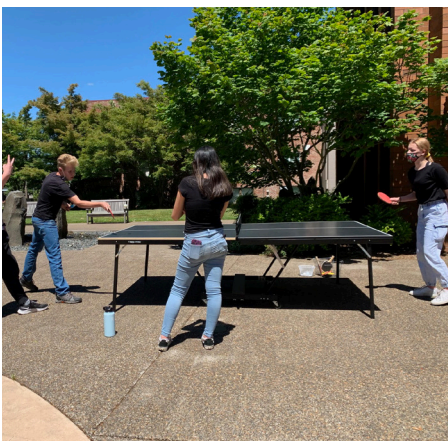
High School Field Day 2.0