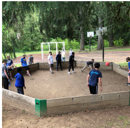
6th grade Outdoor School Day at Camp Yamhill