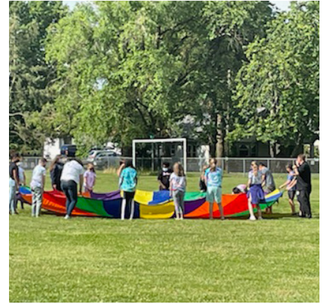
Elementary Field Day