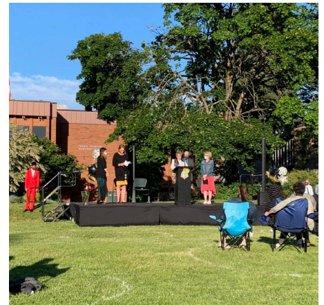
8th Grade Promotion Ceremony