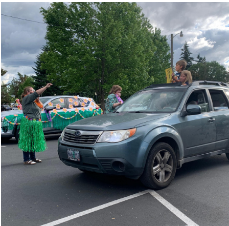
Banner Night Drive-Thru Parade