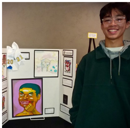
High School Art Showcase