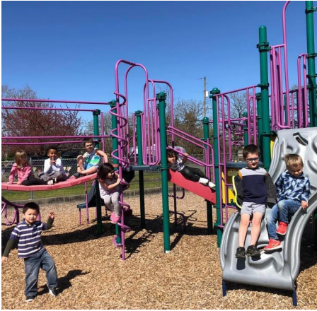
Pre-Kindergarten Extra Recess Fun