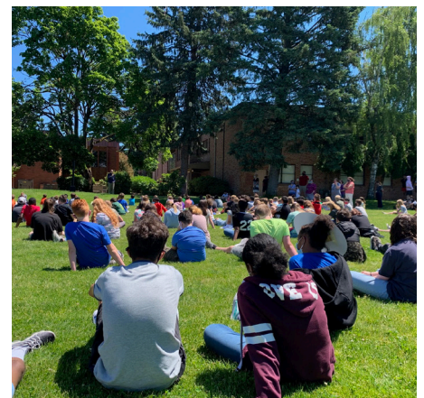
All-School Chapel on the Field