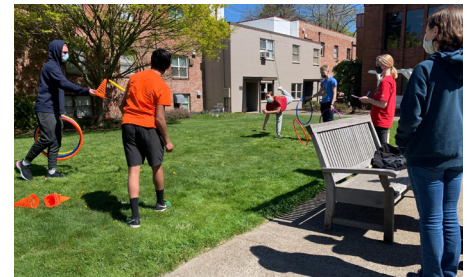
Surprise "Field Day" Planned by Student Government