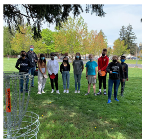
6th Grade Disc Golf PE Class