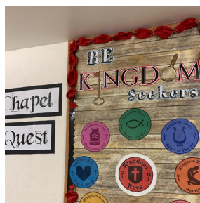
Elementary Chapel Quest: March = Peacemaker, April = Courage