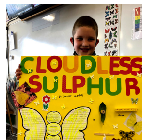
Butterfly Projects with 2nd Grade