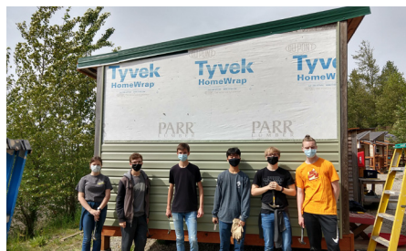
Building Tiny Houses for Geometry in Engineering Class