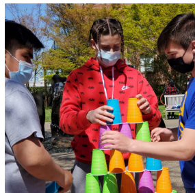
High School Surprise Field Day