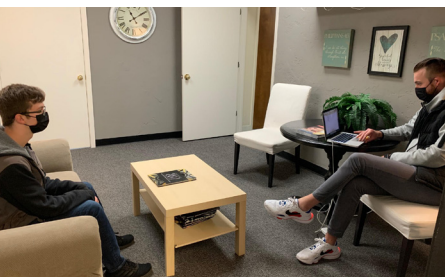
College/Career Planning Meetings with the Guidance Counselor

Columbia's high school faculty and students are making the best of a unique and challenging school year. Though there are some obvious limitations due to health and safety requirements during the COVID-19 pandemic, the Columbia team is committed to the school's core values: fostering relationships, pursuing truth, devotion to excellence, and preparation for an abundant life of Christian leadership and service.