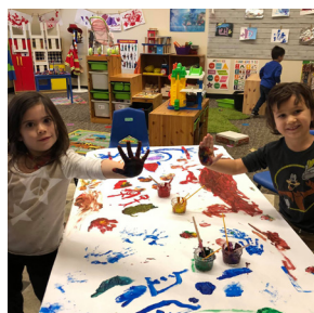
PreK Art is Always Fun (and Sometimes Messy)