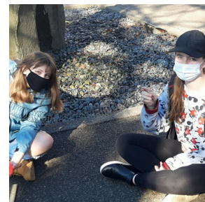
Middle School Earth Science: Sound Waves Unit