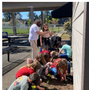
New Flowers Planted by 5th Grade