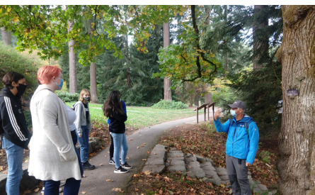
Biology Class at Hoyt Arboretum