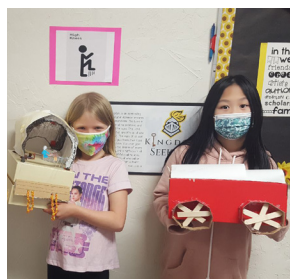
4th Grade Pioneer Book Projects