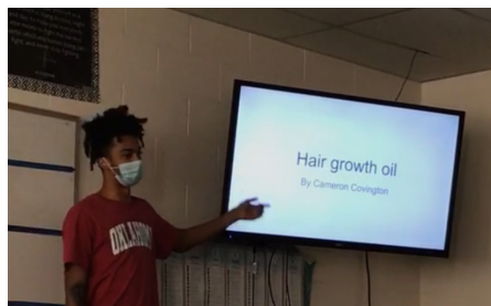
AP English Literature Students Teaching Class