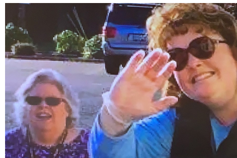
SCHOOL USES DRIVE-THRU CONCEPT FOR HOMEWORK