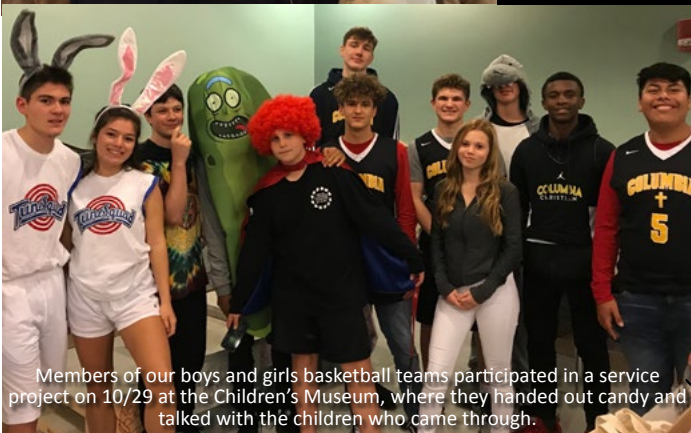
Members of our boys and girls basketball teams participated in a service project on 10/29 at the Children's Museum, where they handed out candy and talked with the children who came through.