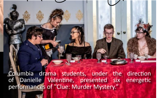
Columbia drama students, under the direction of Danielle Valentine, presented six energetic performances of "Clue: Murder Mystery."