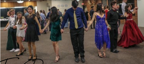
High school students perform a choreographed group dance as part of their formal medieval style banquet.