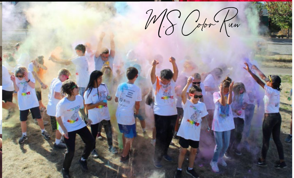
This year was Middle School's First Annual Color Run! The participants were showered with colored powder as they ran. They succeeded in raising over $5,656 for the school.