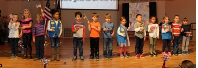
Kindergarten students gave an inspirational performance of "You're A Grand Old Flag" as part of the annual Veterans Day Program. Many community members enjoyed the student-led program, which included inspirational performances of patriotic songs and informative presentations by elementary, middle, and high school students about the history of Veterans Day and different ways to honor veterans. A moving performance of "God Bless America" by the high school vocal ensemble capped off the program. Boy Scouts and Girl Scouts conducted the flag ceremony and distributed gifts to all the veterans in the audience.