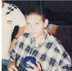
Getting ready on the bus.

carried her Bible to school with few friends who ate lunch in the band room. It was too late to start playing soccer or basketball or volleyball because the coaches only wanted the players that were groomed much earlier, especially when they had so many students to choose from. I yearned for relationships with peers who shared my faith and for opportunities to "belong."