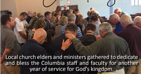
Local church elders and ministers gathered to dedicate and bless the Columbia staff and faculty for another year of service for God's kingdom.